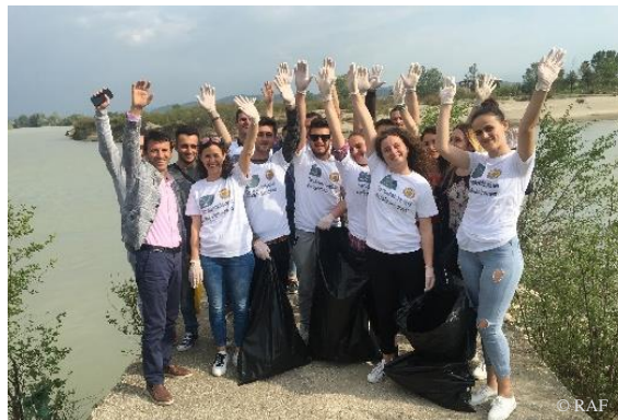
Mobilize and initiate actions