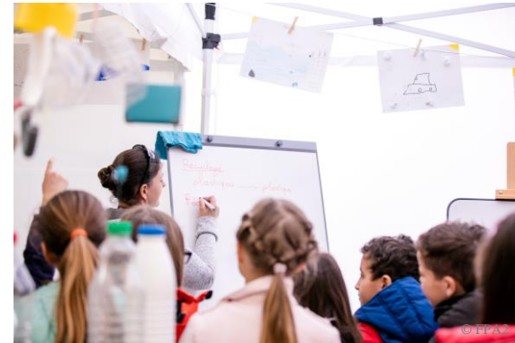
Spread the word